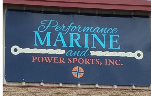
De Soto Business of the Month

Performance Marine and Power Sports, INC. was opened in September 2015 just off I-80 on the P58 (Bentler Exit) and chose to relocate to De Soto, opening their doors here in town on April 1st at 4 Ellefson Drive.